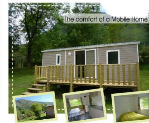
The comfort of a Mobile Home