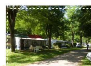
Private outdoor space surrounded by trees